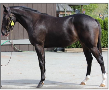
Stanz In Command

The results, as recorded in starts and earnings, allow us to sell with confidence and watch with pride.