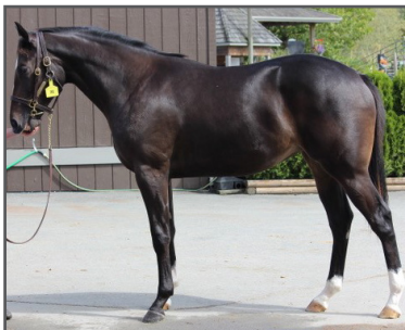
Stanz In Command

The results, as recorded in starts and earnings, allow us to sell with confidence and watch with pride.