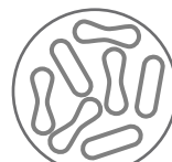
Pre and Pro Biotics